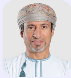
H.E. Eng. Salim Al Aufi Minister of Energy and Minerals, Sultanate of Oman