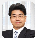
HAYASHI Nobumitsu Governor, Japan Bank for International Cooperation (JBIC)