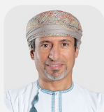
H.E Eng. Salim Al Aufi Minister of Energy and Minerals, Sultanate of Oman